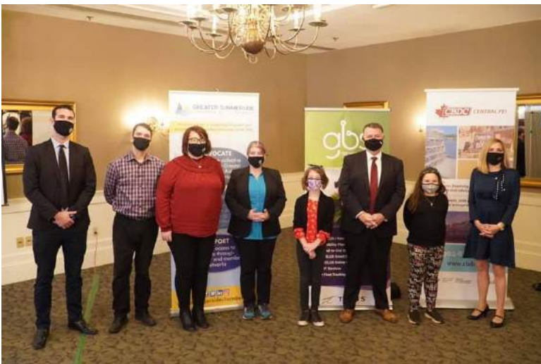
2021 Breakfast with the Premier